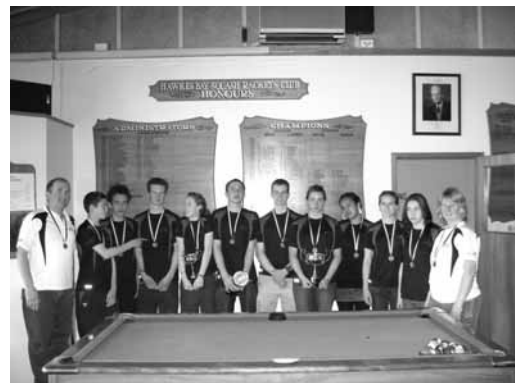
Auckland Junior Representative Teams - both National Champions