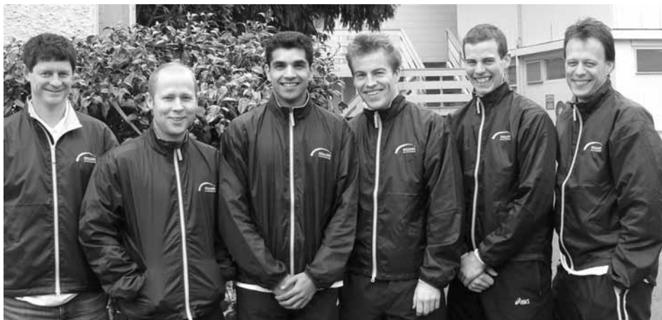
Auckland Men's Representative Team - 2 nd Place