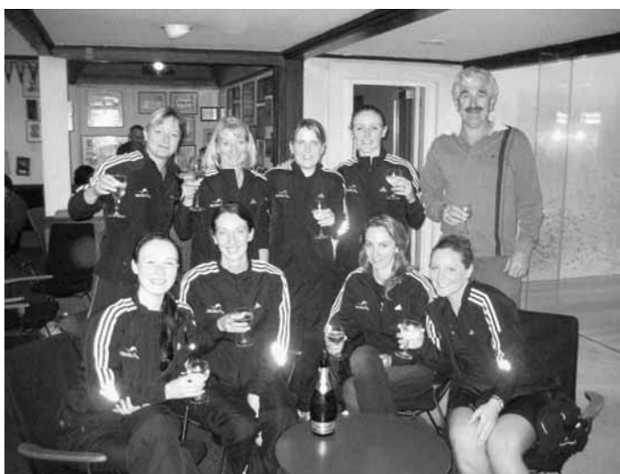
Remuera D Grade Ladies' National Super Champs Winners