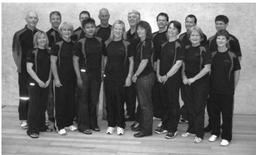
2007 Auckland Masters' Team