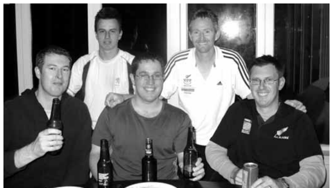
Remuera Rockets Interclub Team Pennant winners in Autumn Div 10 and 2 nd in Winter Div 10