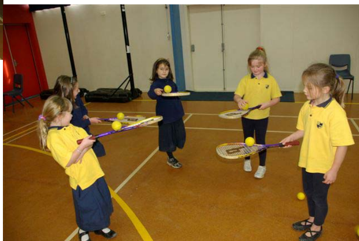
Above: A group of Albany Primary students practice their ball handling skills on the recent Kiwi Sport Squash program