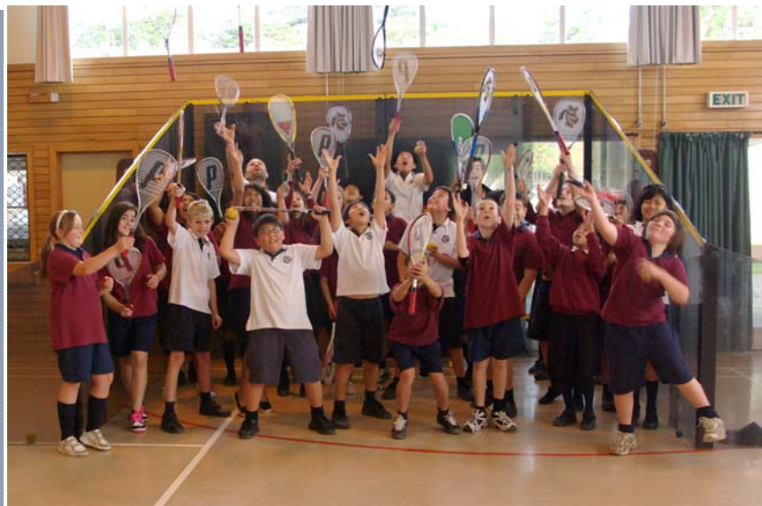
Above: Students from Wairau Intermediate show their appreciation on the recent Kiwi Sport Squash program

The recent Wairau Intermediate Kiwi Sport program saw over 250 students participate in a week of squash. At the end of the program 36 students were invited to attend a mini squash tournament at the North Shore Squash Club. Five students to date have gone on to join North Shore Club as squash members.